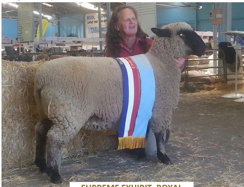
SUPREME EXHIBIT, ROYAL GEELONG