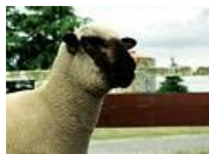
New Zealand Hampshire

The first thing my ram buyers always look for is the rams which have minimal wool on their faces, then followed by height (Which I will mention annoys me some days as some very good rams are left behind that should be going to commercial operations). Their need for bare faces is because many of my buyers have large grass seed burdens, although I have found the Hampshire's to be very fussy and selective when they graze to minimize the potential of getting grass seeds near their eyes.