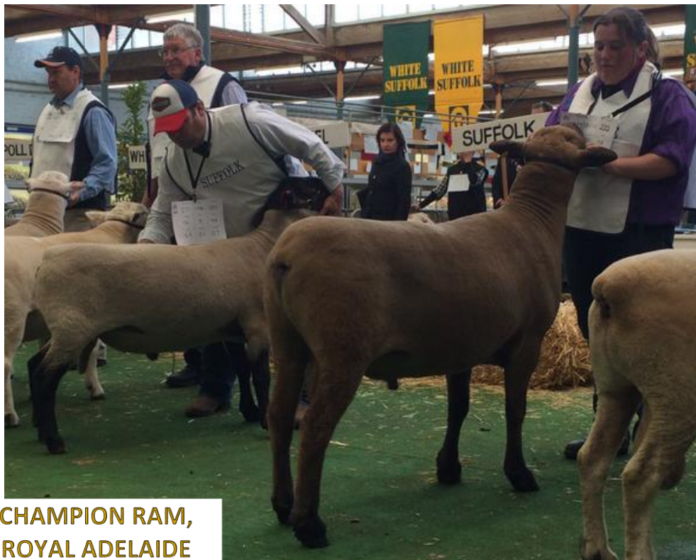
CHAMPION RAM, ROYAL ADELAIDE

Supreme Interbreed Group of Three – Summerville