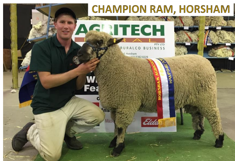
CHAMPION RAM, HORSHAM

Supreme Exhibit – Jurambula (Ewe under 1 ½ yrs in wool)