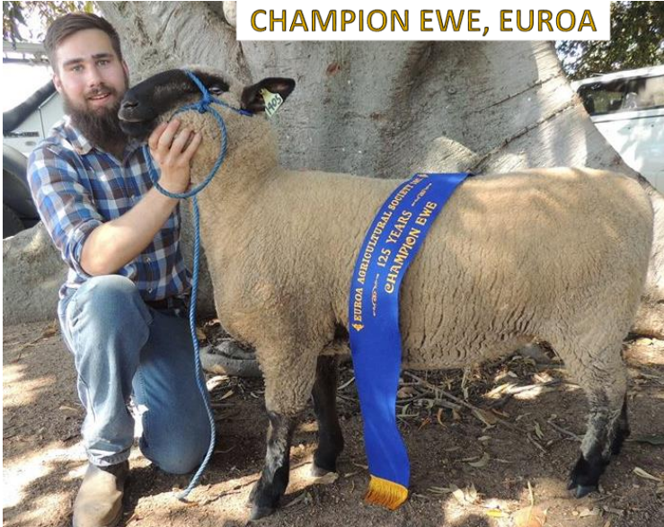
CHAMPION EWE, EUROA

Champion Ram – Glen West (Ram over 1 ½ yrs) Champion Ewe – Glen West (Ewe under 1 ½ yrs)